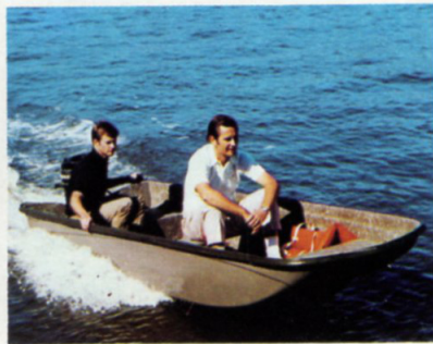
12' MODEL Extra room for extra gear, whether it's hunting, fishing, or fun. Excellent beam to length ratio offers unusual maneuverability. — $257.00