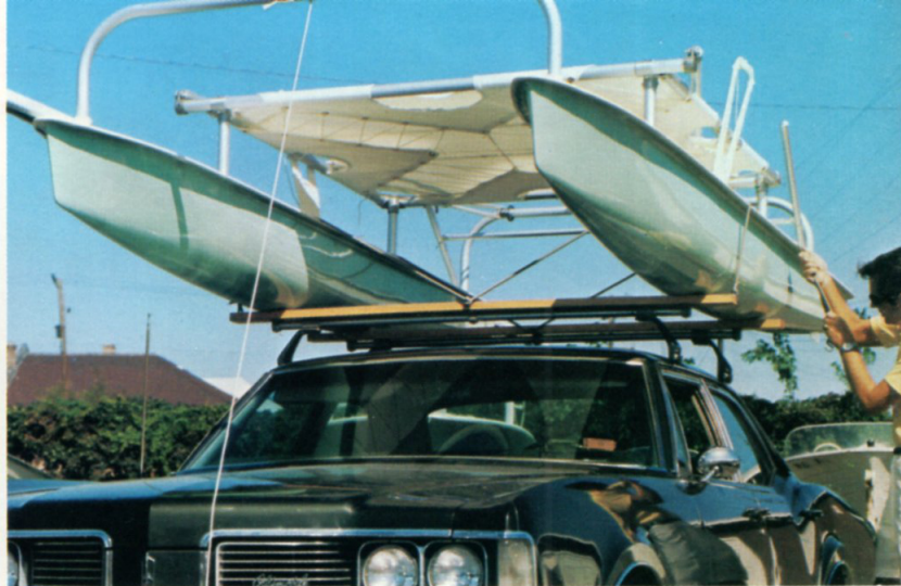
Aqua Cat. Complete with 90 square foot sail and deluxe Dacron deck. $795.00