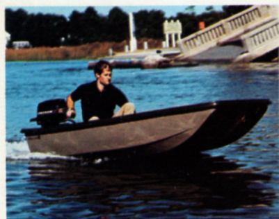
8' MODEL Super stable hunting or fishing boat. An easy to handle, easy to launch cartopper or family camper. — $199.00

Economy priced sportboats for year 'round fishing and fun use. All Bay Fishers are smooth riding Tri-Hulls with built in air chambers and foam flotation. Rugged, safe, and economical, with unusual versatility, the Bay Fisher series answers the need for a low priced, quality boat.