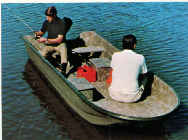
14' MODEL Good all around boat. Designed with the fisherman in mind. Molded-in rod holders and bait wells make this boat a fisherman's delight. — $339.00