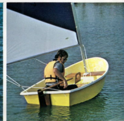
8' DELUXE SAIL