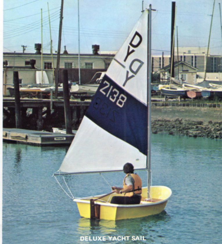
DELUXE YACHT SAIL