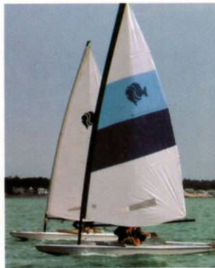
SUPER SUNFISH ®