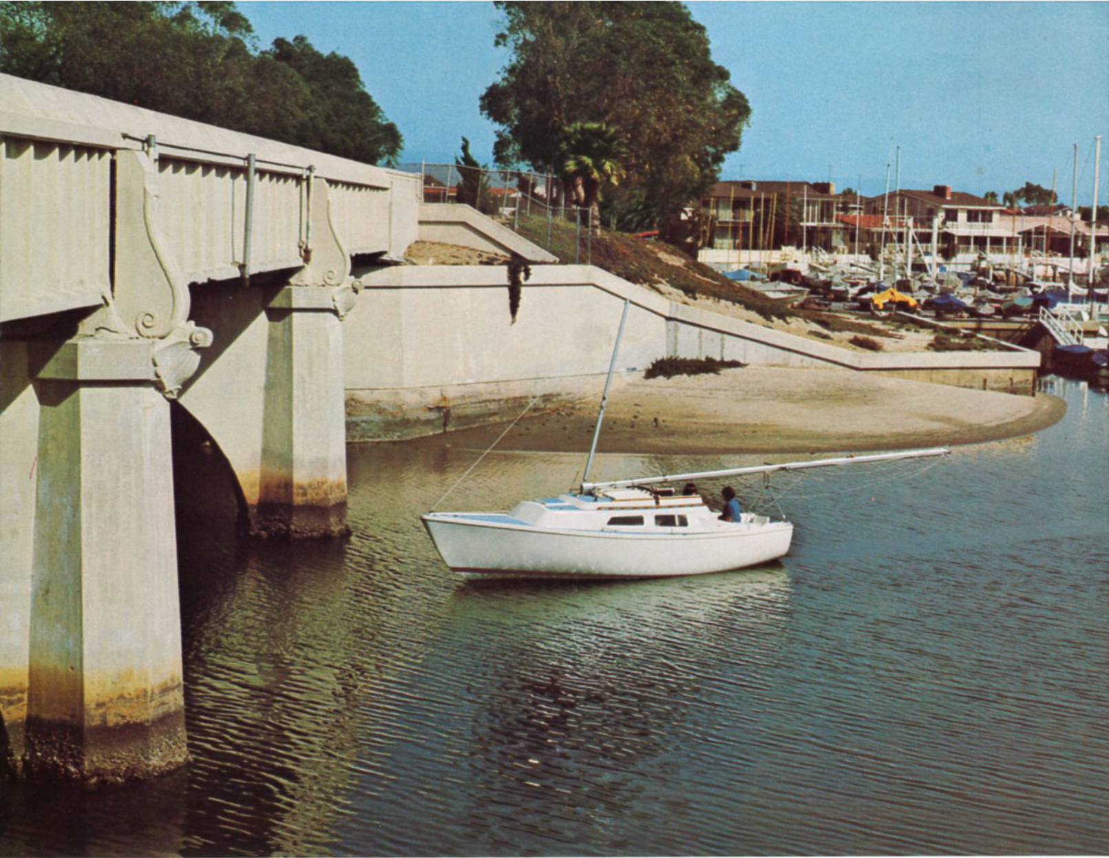
Mast is easily lowered, underway, to clear obstacles. Opens new bays to explore.