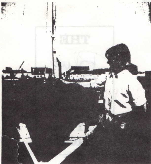
A junior christens her Blue Jay at the beginning of the season. While designed primarily for juniors, Blue Jays are popular among senior sailors too