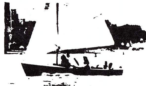
THE BOAT THAT "FITS THE FAMILY"