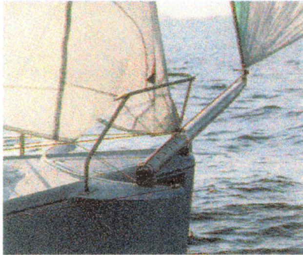
The Famous "Bull Horns"