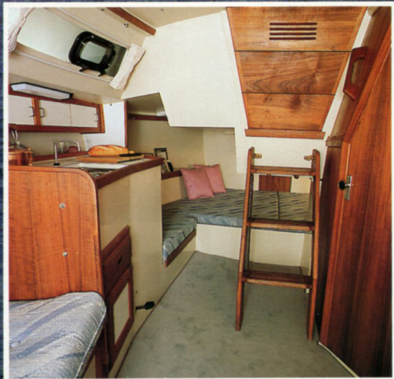
The main cabin, view aft. The aft berth has a port overhead for light and ventilation.