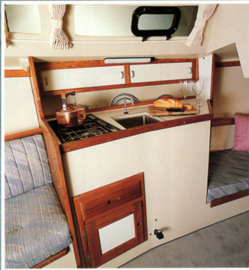
The galley contains a large insulated icebox, two-burner reefed stove, a sink with chopping block insert and fresh water system, storage is behind, above and below the galley counter.