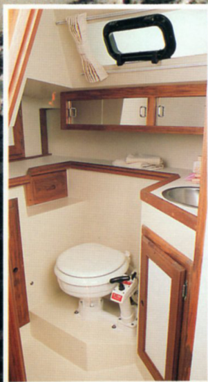
The head compartment has a vanity counter, medicine cabinet and an opening port for ventilation.