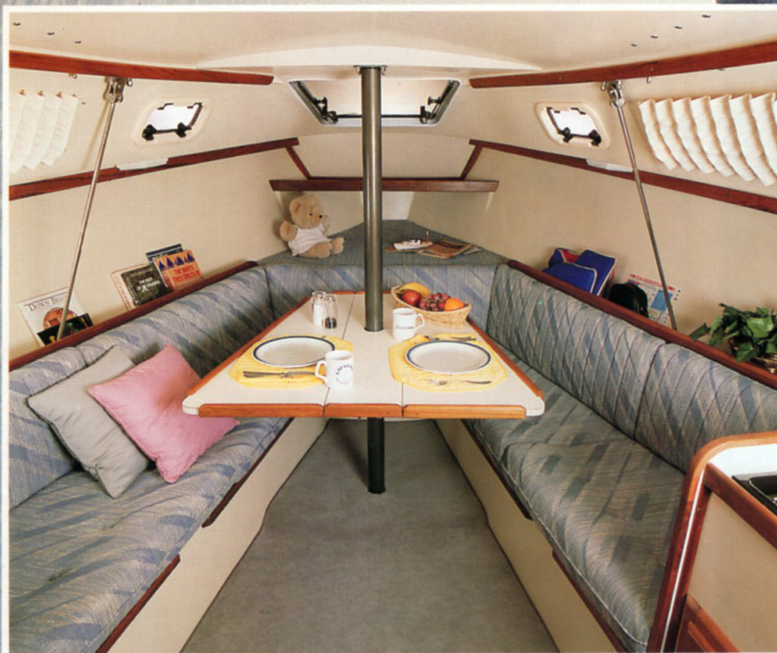
The main cabin, view forward. The drop leaf table accommodates six for meals.