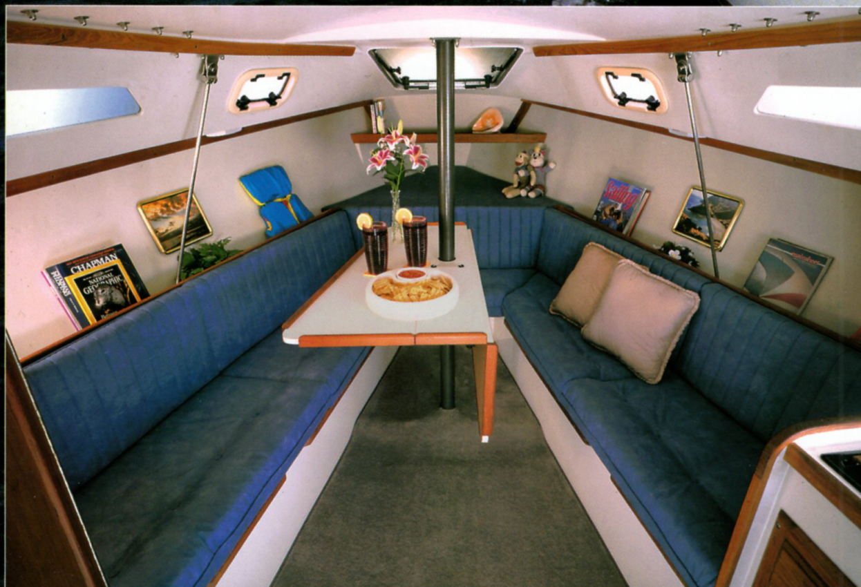
The main cabin, view forward. The drop leaf table accommodates six for me