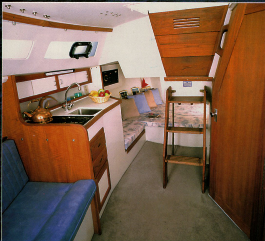
The main cabin, view aft. The aft berth has a port overhead for light and ventilation, via the cockpit