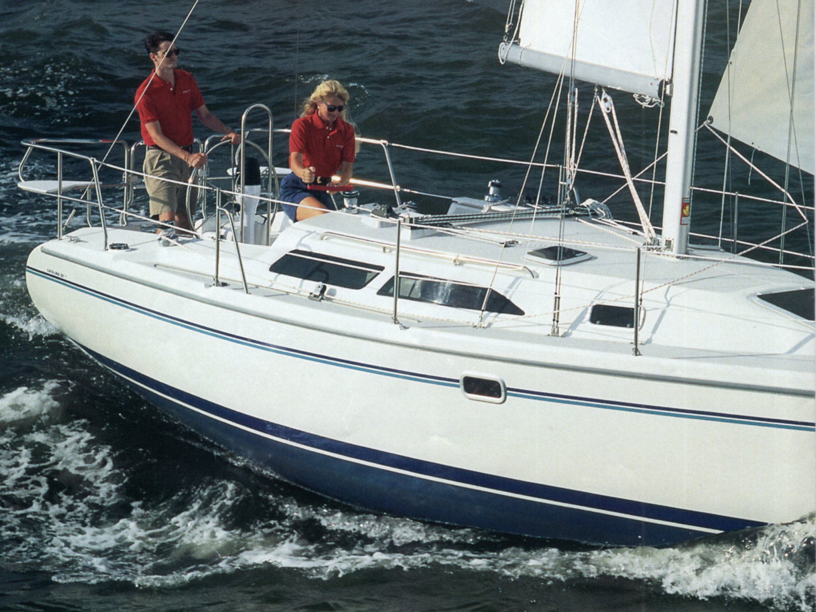
A truly stunning yacht from any angle, the Catalina 28 markII is built with the quality and attention to a sailors' sense of details that make her a sailing pleasure.