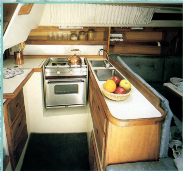
The galley is exceptional for a thirty footer. The stove with oven is gimballed. The ice box is top loading.