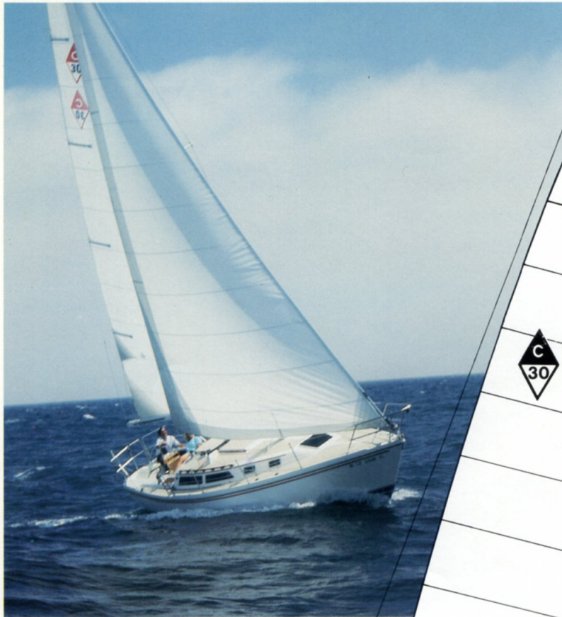
Photo and drawings may show optional equipment. Refer to a current retail price sheet for standard equipment list and specifications.