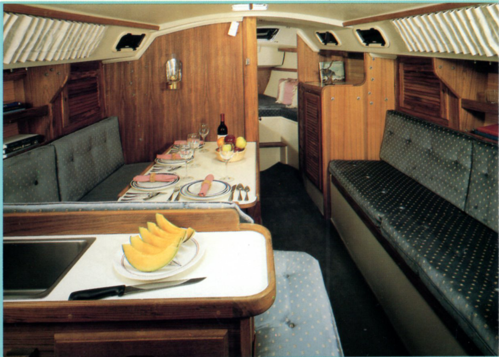
View of Main cabin looking forward. The interior is finished in warm teak and ash. A choice of cushion fabrics are available to create your own Catalina 30...

The styling is crisp and modern incorporating recessed windows and genoa tracks, skillfully combined with a traditional low profile cabin, creating a modern classic to assure years of value and enjoyment.