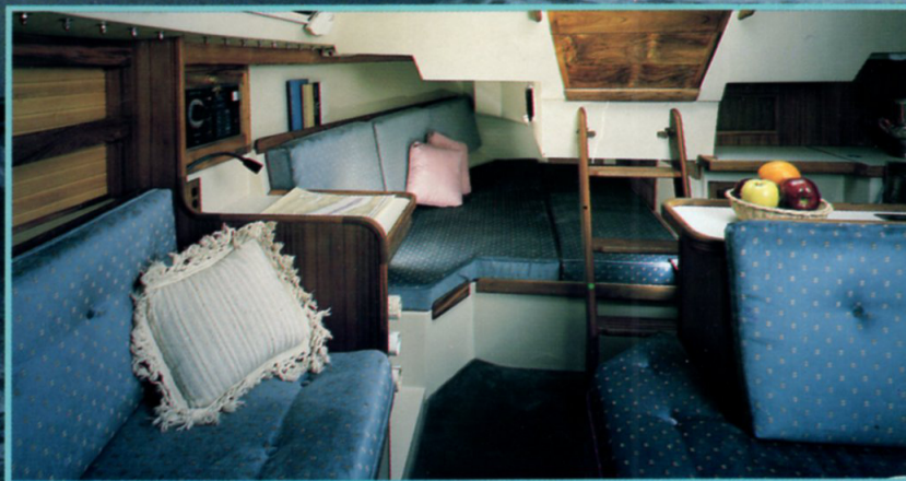
View of the Main cabin looking aft. The aft double berth has a port overhead, for light and ventilation. The navigation desk is handy to the cockpit.