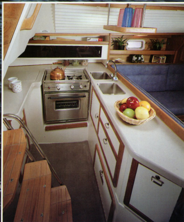
The custom molded sandstone galley countertops highlight the increased counter space that encloses additional cabinets and utensil bin. The handy new overhead storage rack adjusts to accommodate many sizes of dishes, cups and glasses.