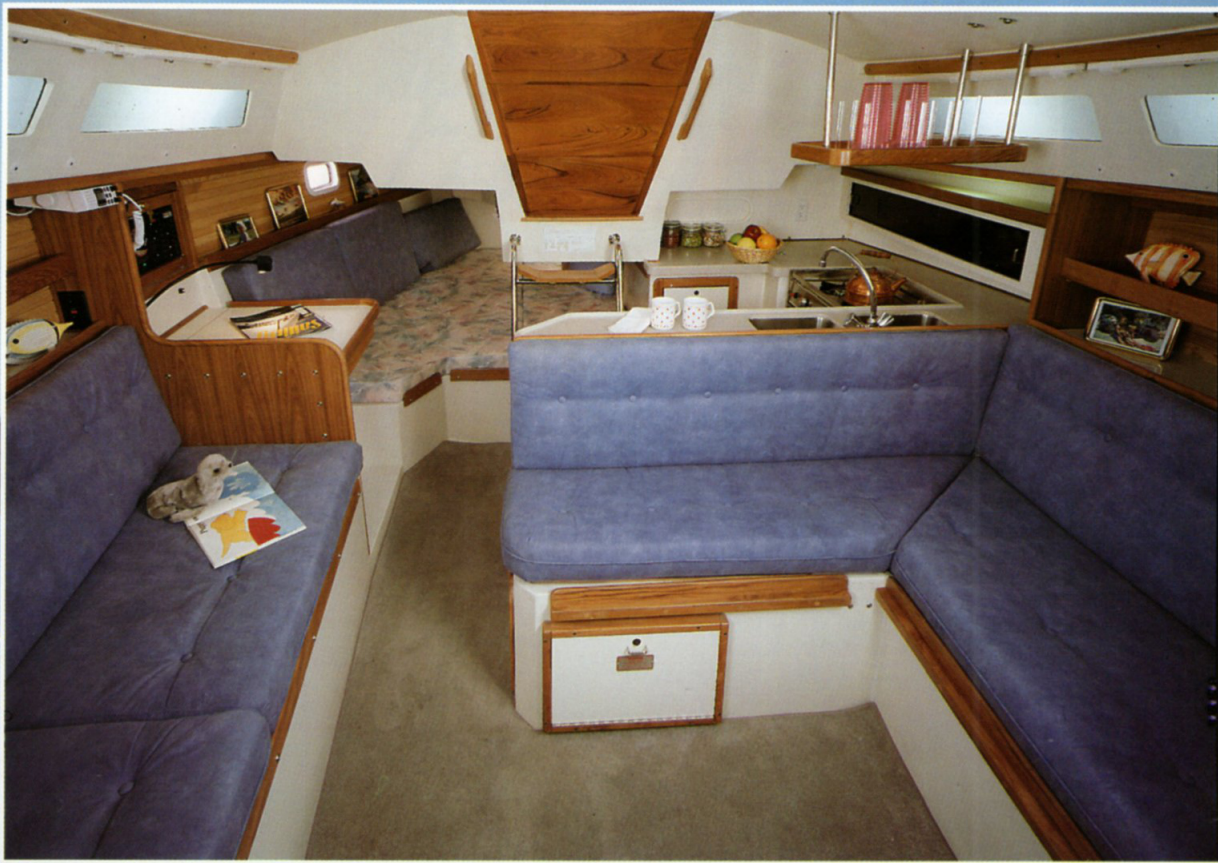
The varnished teak main cabin table is removable for entertaining. Your choice of the traditional "L" shaped settee or a "U" shaped dinette with pedestal table are available.