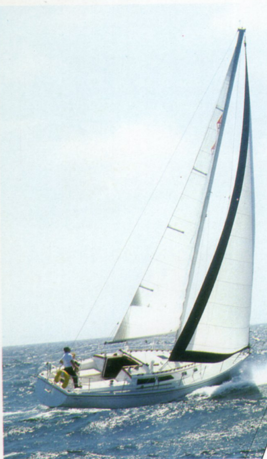
Photo and drawings may show optional equipment. Refer to a current retail price sheet for standard equipment list and specifications.