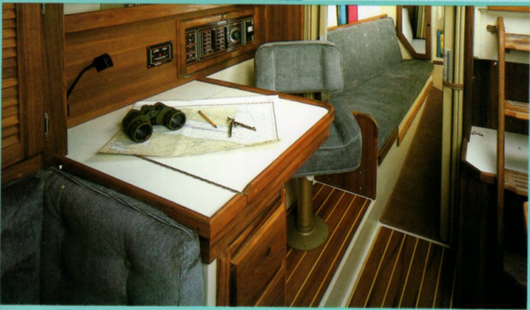
The navigation desk and chair.

The head is forward and to port. Mirror finishes and crisp white laminate trimmed in teak create a bright airy feeling. There is a seat for the shower area and teak grate sole with integral shower sump below.