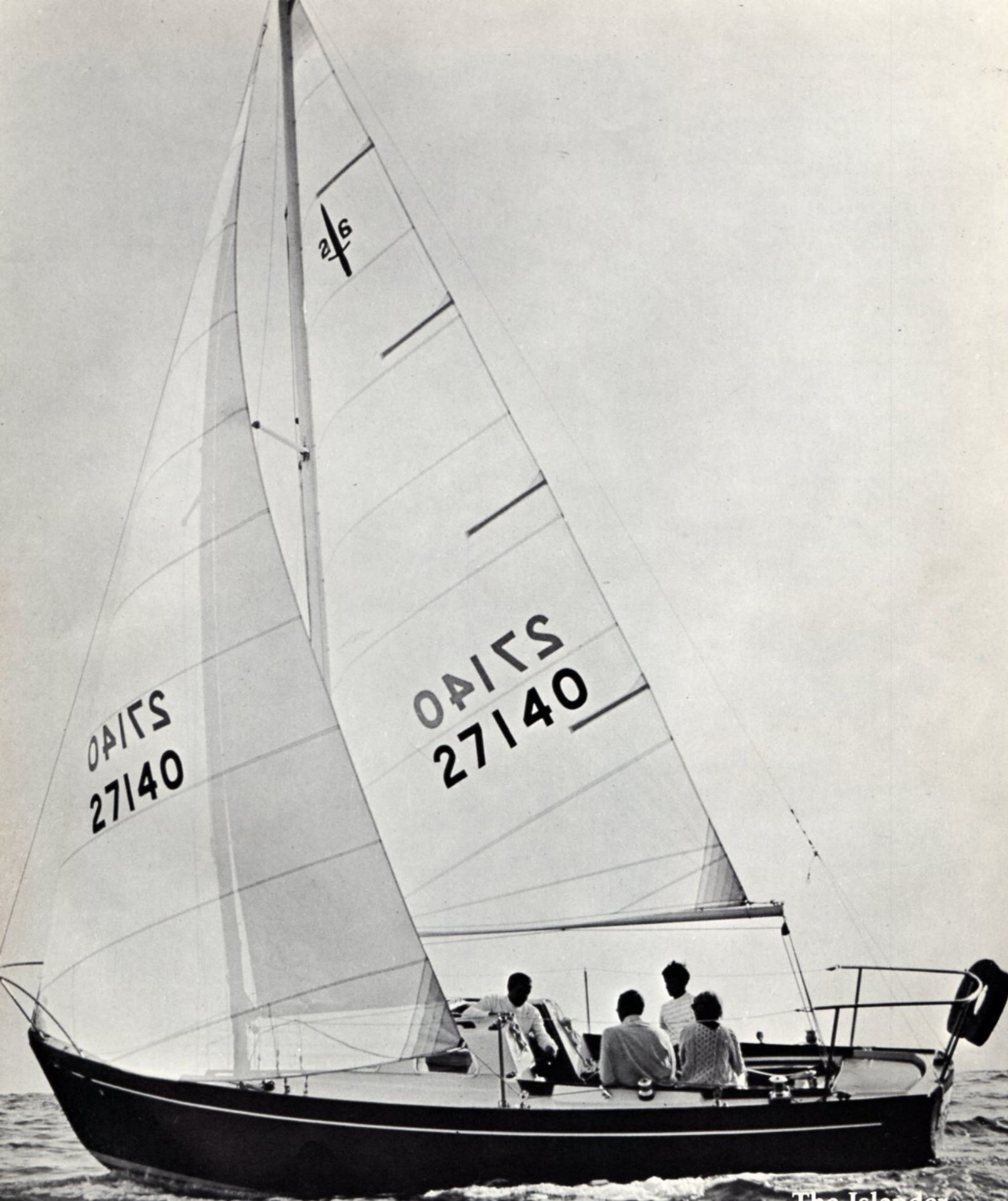
The Islander Excalibur Twenty-Six