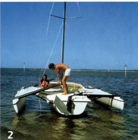
From set-up to sail-away in just 15 minutes.