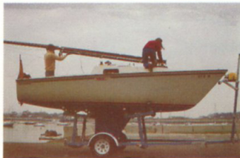
2. Mast is secured to mast hinge plate with clevis pin.