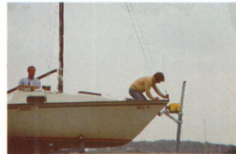
4. When mast is perpendicular to deck, forward clevis pin is secured to mast hinge plate. Headstay is then attached at bow.