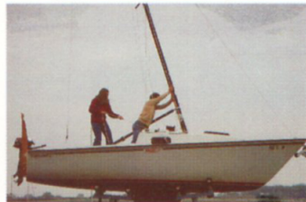
3. One person supports and guides mast into place while a second uses jib halyard around winch to take up slack. Note: Jib halyard is lengthened for this task by adding a docking line.