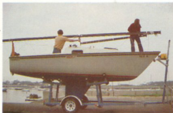
1. Mast and boom are removed from their trailering position. Shrouds are already attached to boat.

Two people working together can have the boat in the water in minutes.