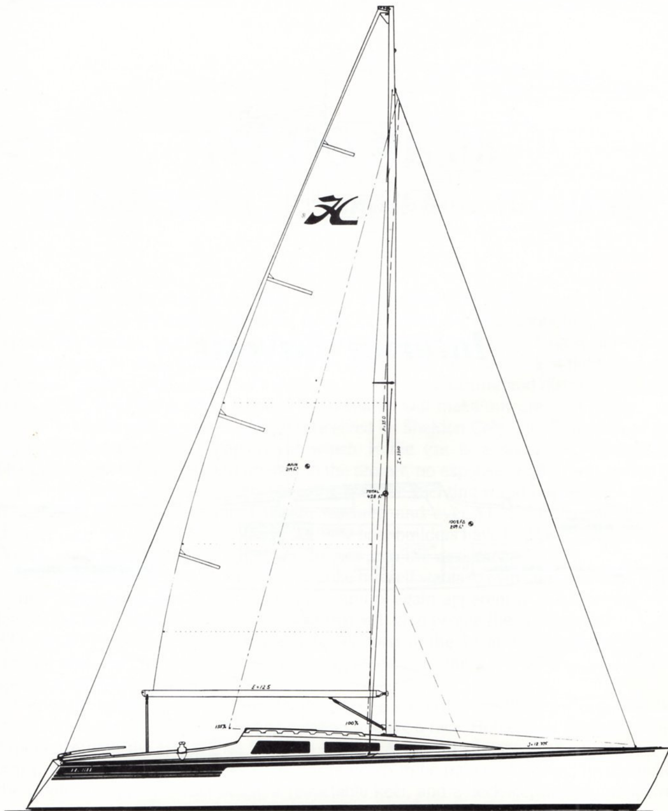
THE HOBIE 33