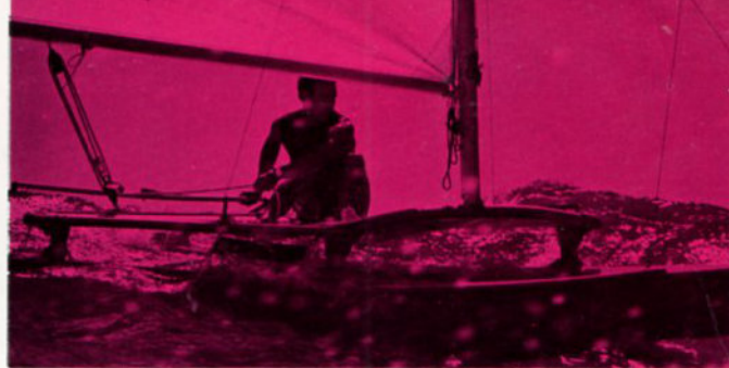
The 14 foot Hobie Cat was designed, developed and is now built by Californian Hobie Alter of surfboard building fame.

"A wild experience in Hawaii is to take a ride on one of the forty foot Waikiki Beach cats as they sail and surf at lightning speed over the shallow reefs. For many years I have been impressed with the simplicity and efficiency of these beach cats, especially the ease with which they sail on and off the beach and in the surf without the use of centerboards. These big cats can sail efficiently with no centerboards because of their asymmetrically designed hulls. I wanted to incorporate this hull principle into a small catamaran. A fast exciting boat that was simple to sail but most important of all, a boat that one man could handle. Built light for racing and easy beaching, yet tough enough to sail right in the surf. Of top quality, yet reasonable in price. My goal was to include features in the boat that I found lacking in most present day comparable catamarans. These features may go unnoticed by the novice sailor but will be quickly recognized and appreciated by the experienced sailor." — HOBIE ALTER