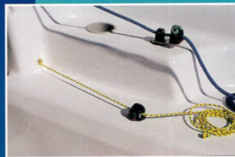
Easy to Handle Rig