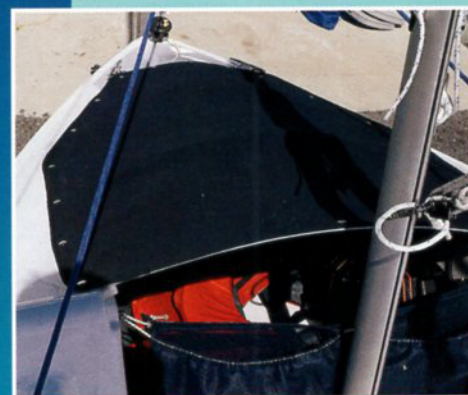
Dual Access Storage