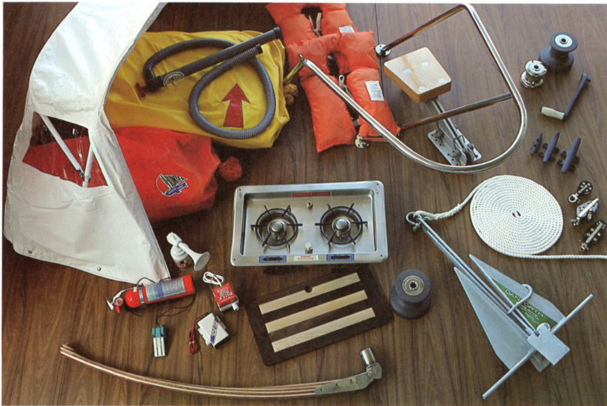
Most Hunter extras aren't extra...they're standard.

This kind of quality doesn't come in a hurry. Hunter sailboats don't come off an assembly line at breakneck speed. But, then again, that's not our aim. Because we feel that every boat we build makes a statement about ourselves. About the skills, dedication and pride of our people. Which makes a lot of sense when you realize that, at Hunter, our only concern is the construction of family cruising sailboats that are better than any afloat.