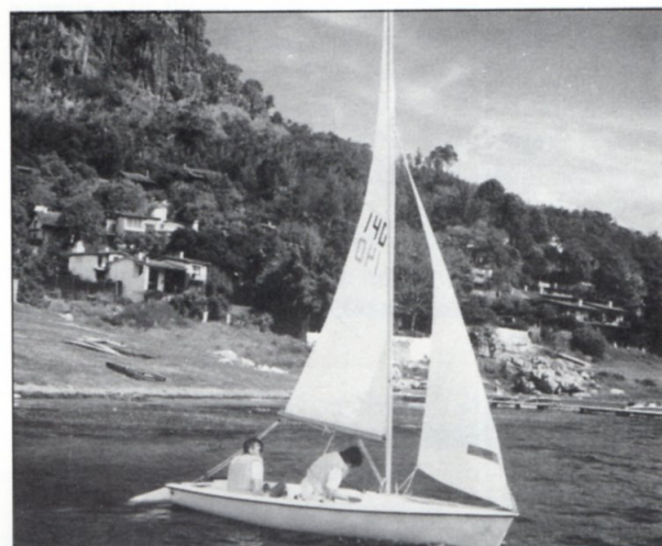
Try a racing vacation in Mexico

Pack your bags and don't forget the suntan lotion! This year the Midwinters will be held in Valle De Bravo, Mexico. Club Vela La Peña will graciously host the event on March 15-17. Members of the Club have volunteered the use of 30 boats to the North American challengers.