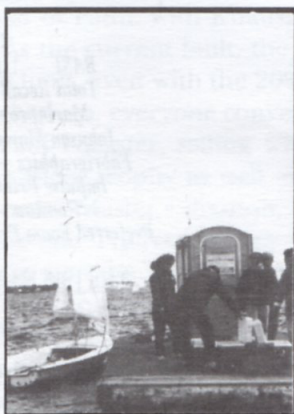
The Infamous Honey Barge!

One Honey Barge 2 porta potties 600 granola bars 4 large orange markers 1 standoff buoy 6 mark boats 4 crash boats 1 spectator boat 1 midline buoy Steady winds Tide Waves Some pesky photo boats 1 shotgun 8 radios 2 tape recorders Shapes 1 Z flag 200 gallons fuel 75 sandwiches (Race Committee) 25 volunteers 3 Judges