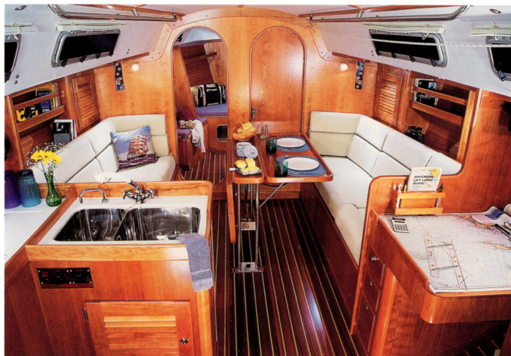
Optional cherry interior