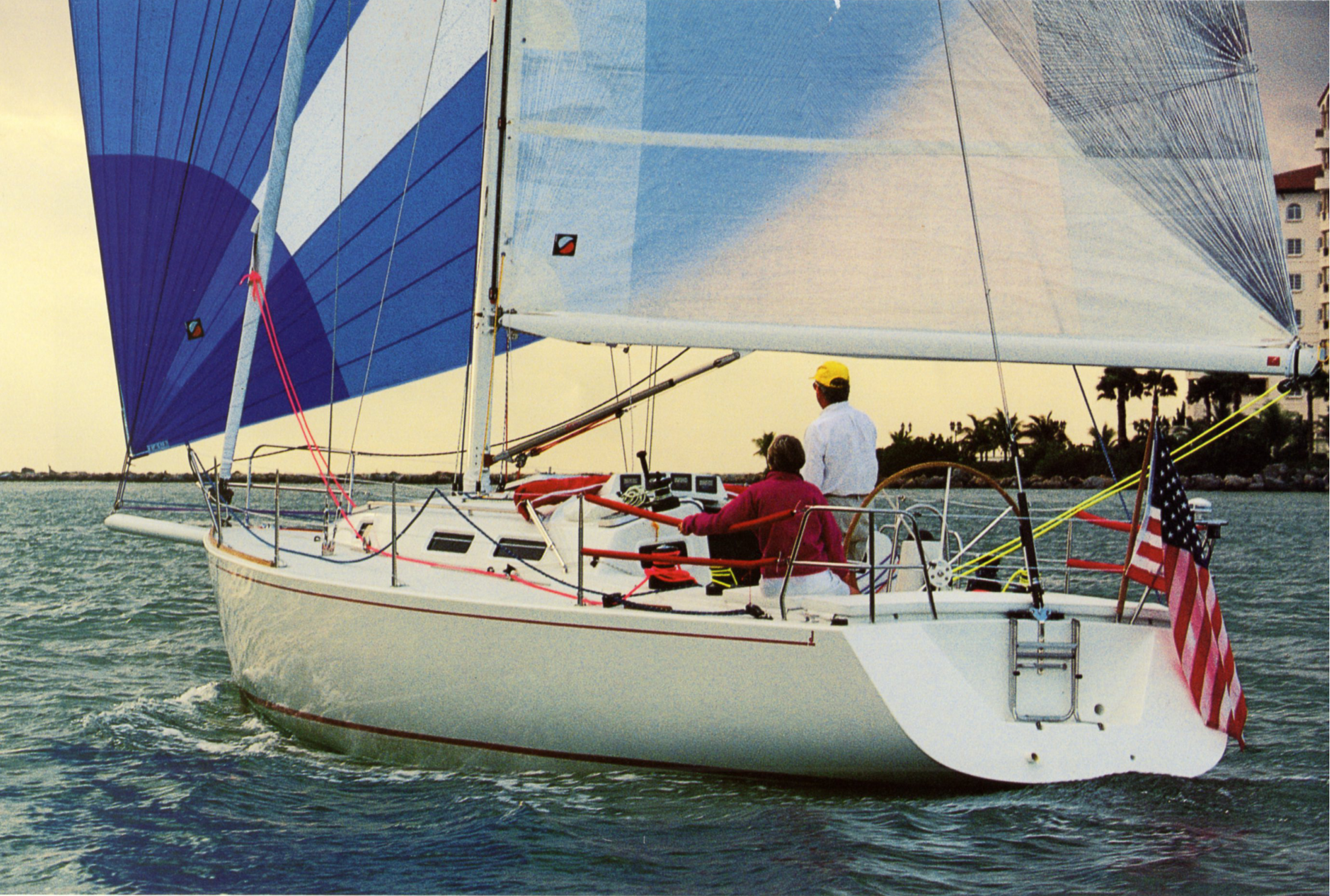
Optional features are shown in above and opposite views.