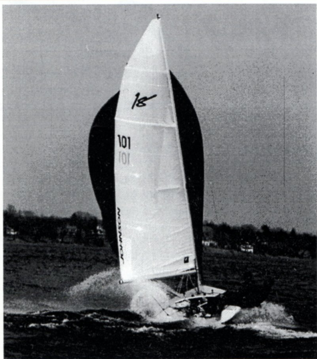
A Johnson 18 shredding waves on White Bear Lake last fall. With the water temperature at 34 degrees, and the air temperature at 20 degrees, the incentive to stay dry was great!