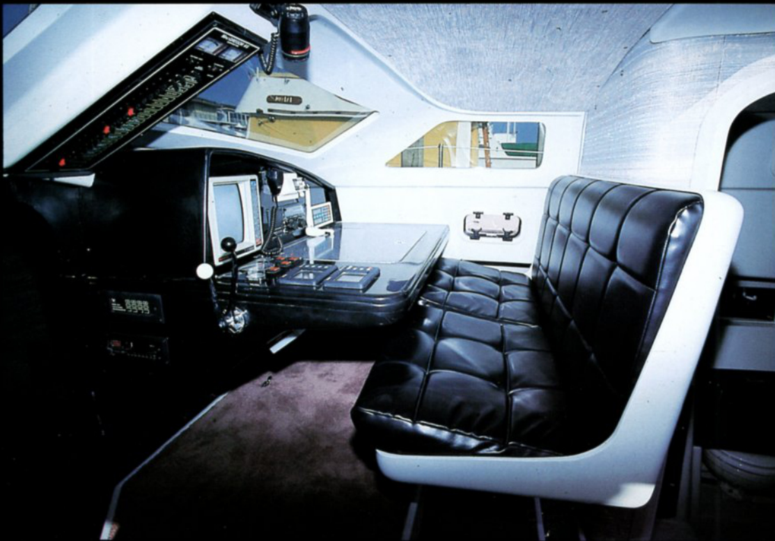
The inside steering and navigation station is shown with a second set of engine controls, push button electronic steering, autopilot, VHF radio, loran, single sideband high seas radio, stereo and radar.