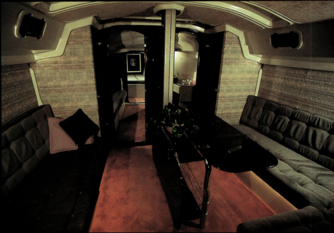
This photo of the main salon, taken at night, shows the effective use of indirect lighting.