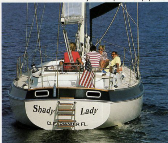
Built in the U.S.A.