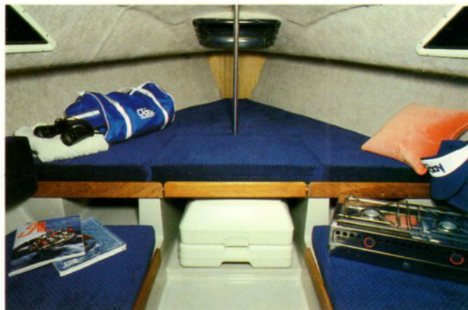
The vee berth has storage under, in addition to a fitted space for the portable toilet (optional).