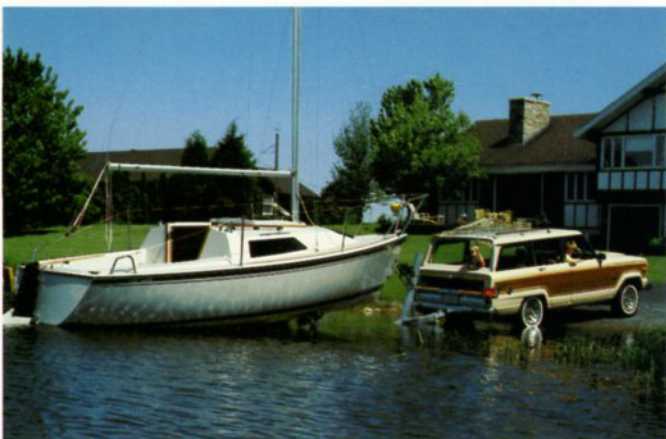
Total trailering package is less than 2,000 lbs. Tows easily behind mid-size cars.

The O'Day 192 deck is designed to offer crew security along with comfort below. The deck along the cabin house is wide enough to afford easy footing and narrow enough to allow maximum useable cabin width below decks. There is a framed opening hatch forward for light and ventilation. The mast is stepped on deck with a tabernacle for easy raising and lowering (the mast is supported below deck by a stainless steel load-bearing column.) Decks are finished in O'Day two-tone colors with non-skid molded in. There is also a teak-capped toe rail for added safety and appearance.