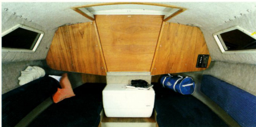
Two extra-long settee berths are comfortable for sailors over six feet, with storage extending under the cockpit.

Specifications in this catalog (standard equipment, options, etc.) are subject to change without notice. Some photographs may show optional or special equipment or photo props. O'Day boats are categorized as Daysailers 12-17, Trailerable Cruisers (O'Day 192, 222, 272) and O'Day Yachts (302, 322, 35 and 40).