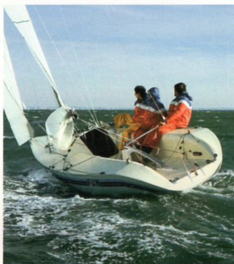
Every piece of raceboat hardware shown here is standard.