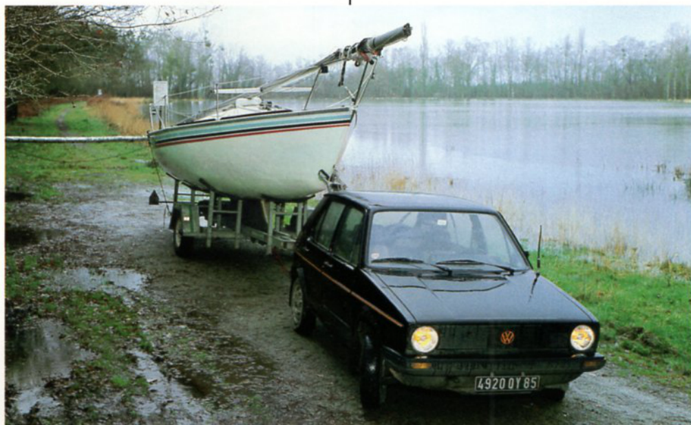
Boat, gear and trailer are less than 2400 lbs.

FUN was designed with the automobiles of the 1980's in mind. You can trailer FUN to regattas from sea to shining sea. The stainless-steel worm-drive lifting mechanism for the fin keel and a removable inboard rudder quickly reduce the boat's underwater dimension to just 24," meaning a much lower center of gravity for the trailer load and reduced twisting load on the trailer hitch. The 1900 lb. weight is easily managed behind almost any European-sized car or small truck. Launching is done on a ramp, just like a daysailer. The deck-stepped mast can be raised or lowered by just two people and without a crane. (There is additional support for the mast step below deck to take up the strain of high rigging loads and mast compression.)