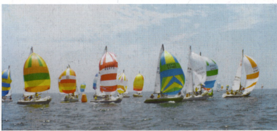
ONE-DESIGN FLEET RACING