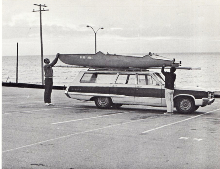
The SEA SPRAY is easy to lift onto a car and can be legally carried on a compact car.

The design emphasizes lightness, both for ease in transporting and handling out of the water, and for racing performance and manuverability in the water. The hull design was optimized by computer. The boat is rugged. Construction is of maintenance-free fiberglass and corrosion-proof metalwork. Dual flotation tanks and a sealed-tube mast provide unsinkable safety and single handed righting in case of capsizing.