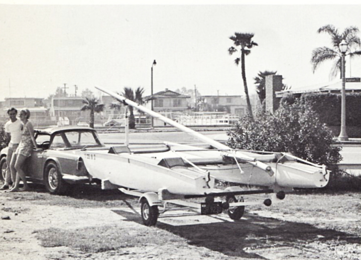
The SEA SPRAY trailer is easy to tow with a sports car.

I continue to use my SEA SPRAY for family fun and to win the big A Class races. You need sail it only once to be convinced that it uniquely achieves the goals I had in mind.