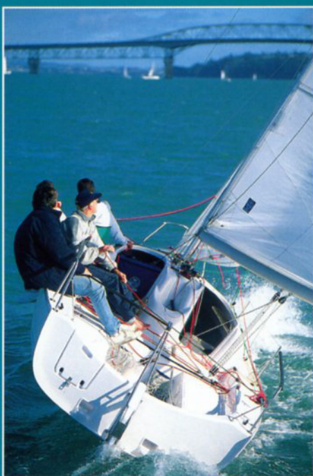
POWERFUL WINDWARD PERFORMANCE.