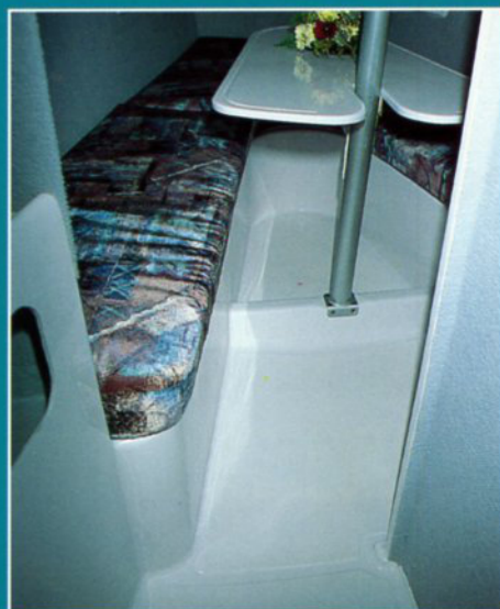
QUALITY CONSTRUCTION AND CRUISING COMFORT.