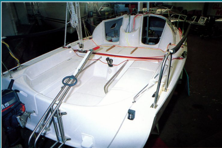
THE LARGE, DETAILED COCKPIT DESIGN.