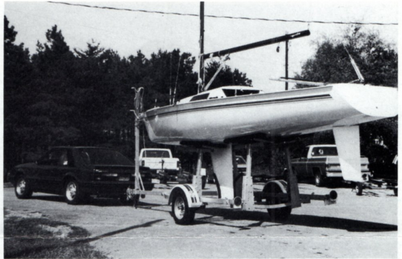
Easily trailered and launched by small car.

LOA ..... 23'9" LWL ..... 20'0" Beam ..... 5'7" Draft ..... 3'6" Displ. .... 875 lbs. Ballast ... 440 lbs. S.A. .... 186 sq. ft.