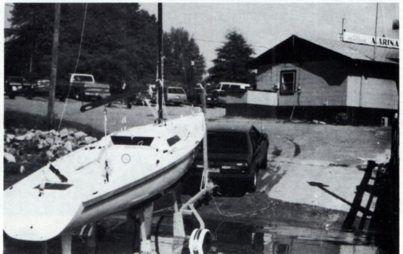
*For some launchings, trailer tongue extender helpful.