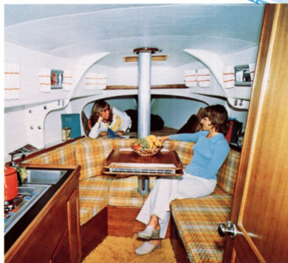
Forward compartment has quarter berth under double berth and chain locker in bow. Settee berth and after quarter berth complete sleeping accommodations for five.

Nonetheless, she's all Yankee in 100% hand lay-up fiberglass construction, one-piece hull with molded-in cove and contrasting boot top, one-piece deck with molded-in non-skid, teak toerail, companionway drop slides and trim. Mast is Yankee custom elliptical aluminum extrusion with special masthead and offset spinnaker halyard crane. Standing rigging is stainless steel with 7/32" head and backstay, 1/4" upper and lower shrouds, 1/8" midstay. Boom is round grooved aluminum and roller-type mainsheet traveller is cabin-top mounted. All underwater thru-hull fittings are equipped with valves.